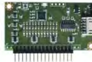
PM 6250 Control Board